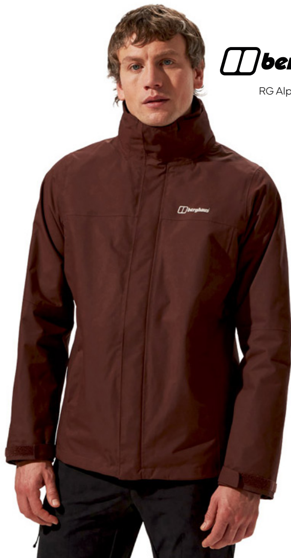
berghaus RG Alpha 2.0 Jacket