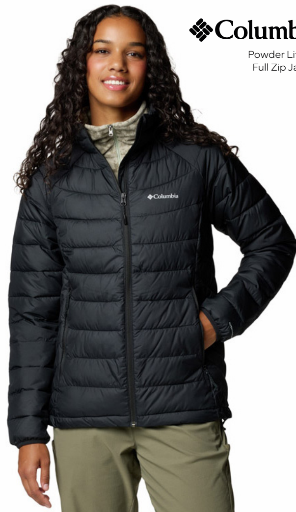
Columbia Powder Lite™ II Full Zip Jacket