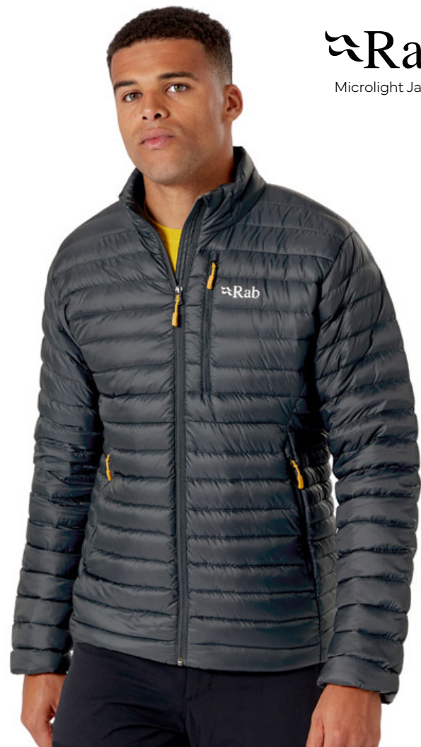
Rab Microlight Jacket