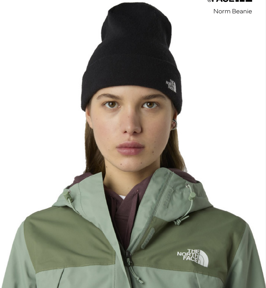
THE NORTH FACE Norm Beanie