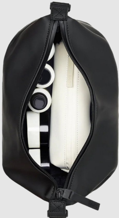
RAINS Hilo Wash Bag