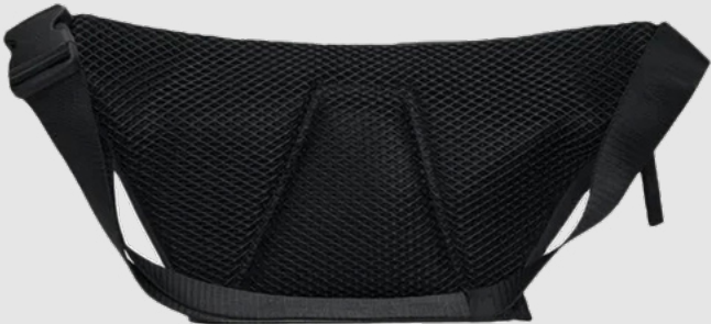
RAINS Bum Bag W3