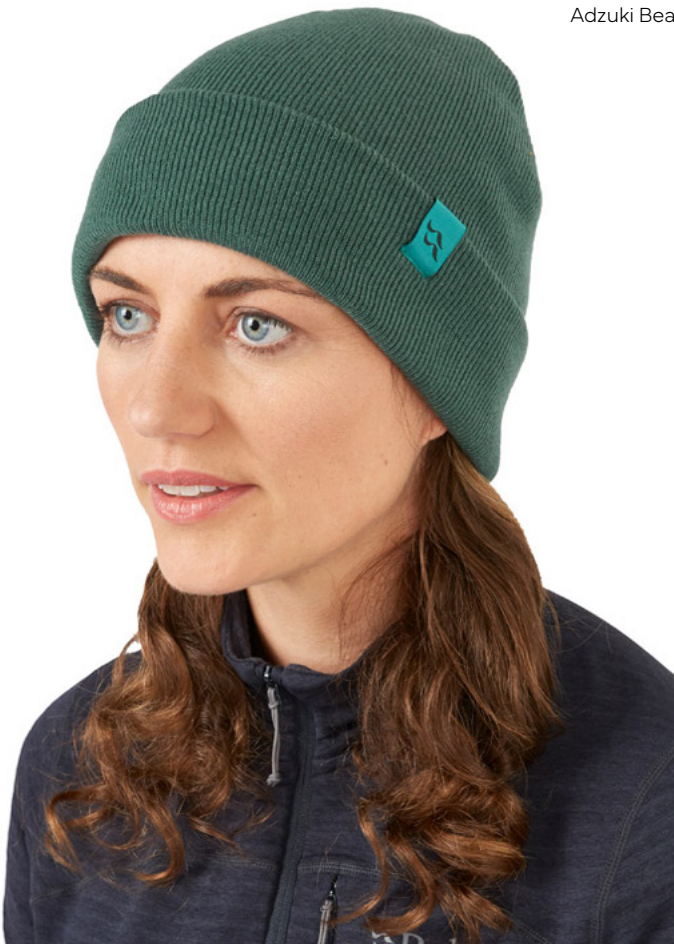
Rab Adzuki Beanie