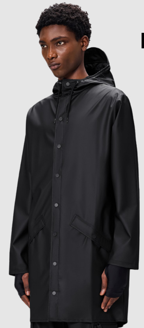
RAINS Long Jacket W3