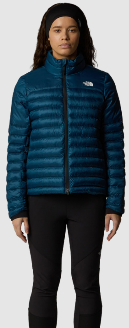
THE NORTH FACE Terra Peak Jacket