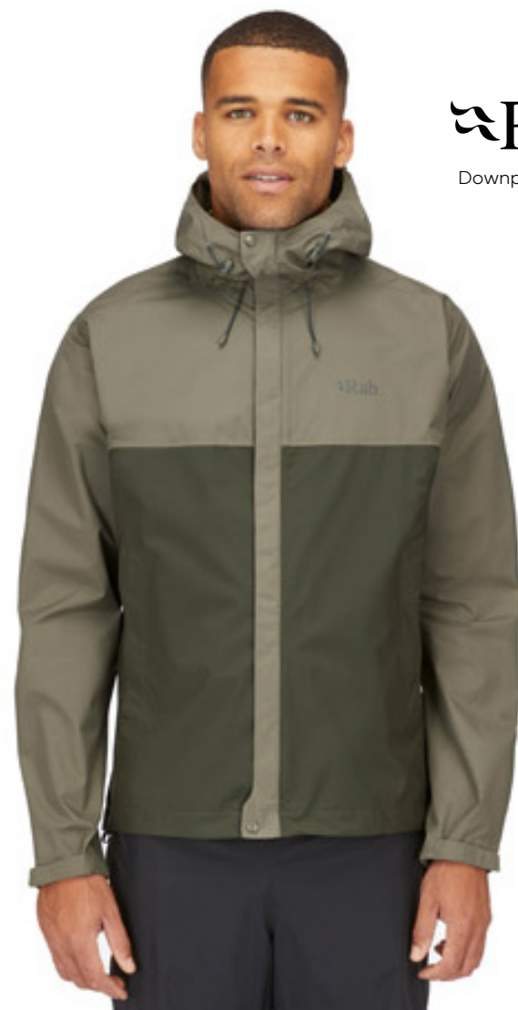
Rab Downpour Jacket